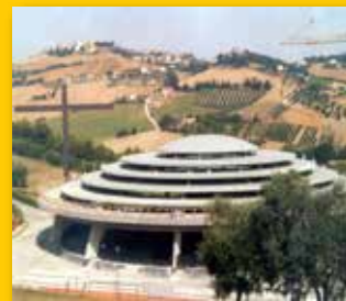
CONVENTION SITE - ITALY -