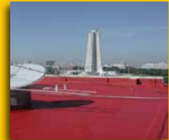
STATE MINISTRY - CUBA -