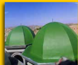
DOMES - IRAN -