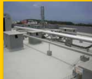
HOTEL - SPAIN -