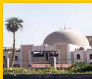
MOSQUE - SYRIA -