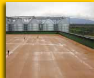
FOOD FACTORY - ITALY -