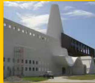
RESEARCH CENTER - BRAZIL -