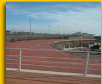
BEACH CLUB - ITALY -